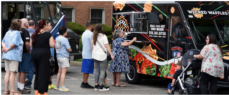
The lines were long for the four food trucks that arrived each Saturday in the school parking lot.