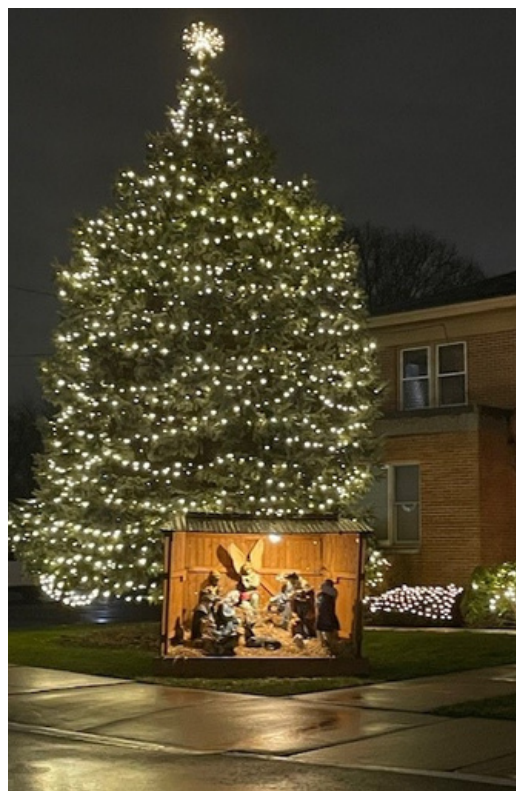
Crèche and tree outside church